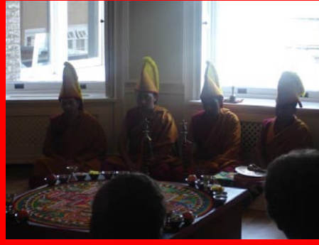
Closing ceremony of Buddhist monks dismantling the sand mandala at Asia House, London, to symbolise the impermanence of all that exists.