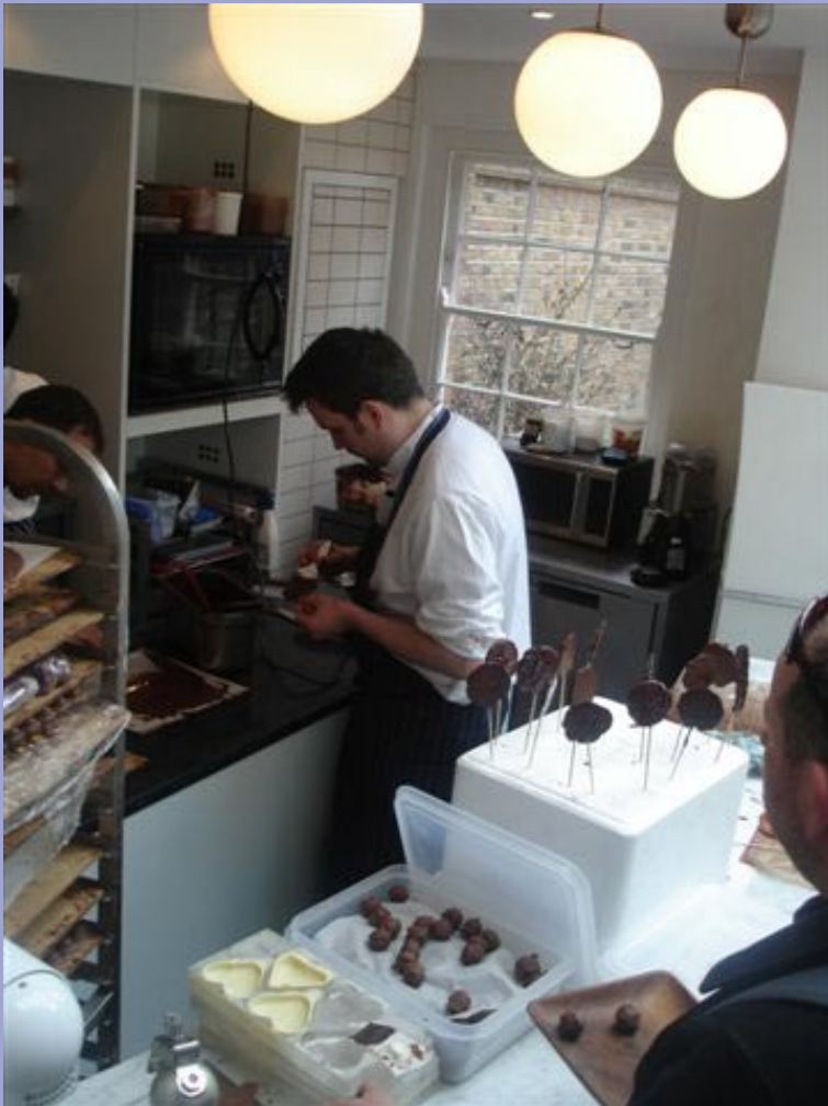
Notting Hill based chocolatier Melt: fresh chocolates are made on site and are best eaten on sight.

When the Hong Kong Mandarin Oriental shut down for refurbishment it brought fear into the hearts of regulars who were bereft without their rose petal jam.