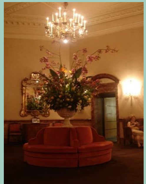
Flowers though temporary, lift the soul permanently.