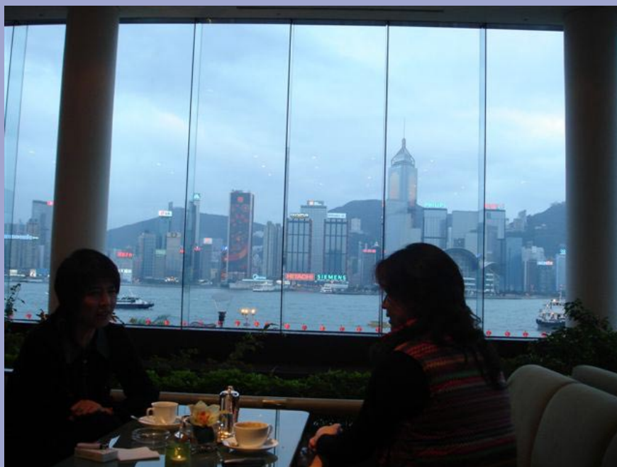
View from Intercontinental and Felix at The Peninsula, Hong Kong: views by their definition are temporary and individual to each of us.