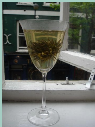
Fine green tea from Yunnan unfolding.