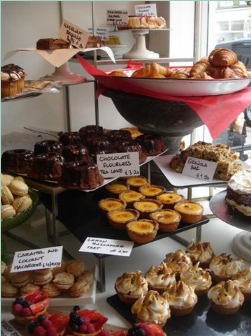
The food at Ottolenghi in Notting Hill is all hand crafted with extreme care: you are what you eat.